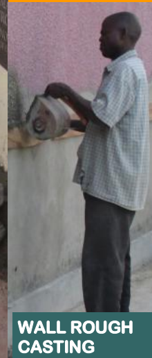
WALL ROUGH CASTING

Renovation of Papoli primary school has started and all concerned parties are carrying out different types of repair work to enable the school have a fresh new look. The repairs are being done right from the floors to the veranda, walls which are also being painted and the ceiling. The renovations are majorly carried out to prevent the small damages from becoming bigger and more costly in the long run.