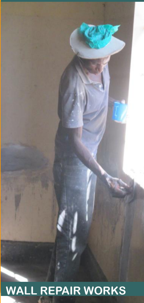
WALL REPAIR WORKS