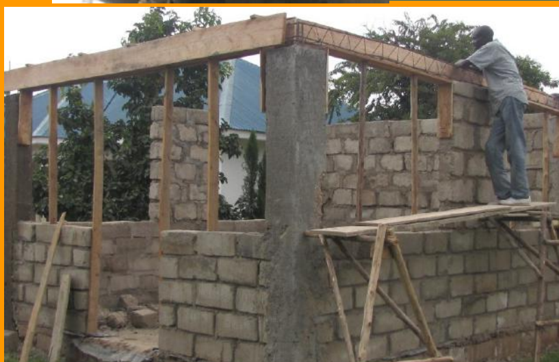
ANTENATAL AND FAMILY PLANNING WAITING SHADE UNDER CONSTRUCTION

Renovation of Papoli primary school has started and all concerned parties are carrying out different types of repair work to enable the school have a fresh new look. The repairs are being done right from the floors to the veranda, walls which are also being painted and the ceiling. The renovations are majorly carried out to prevent the small damages from becoming bigger and more costly in the long run.